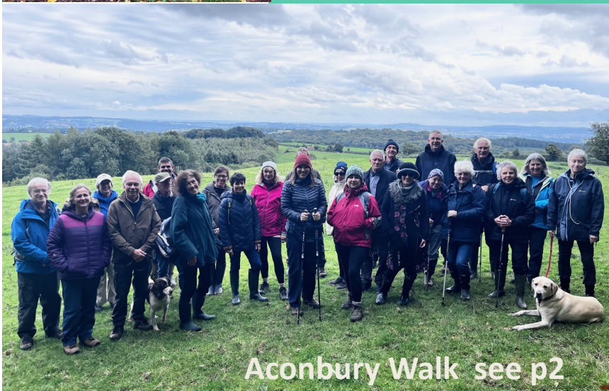
Aconbury Walk see p2