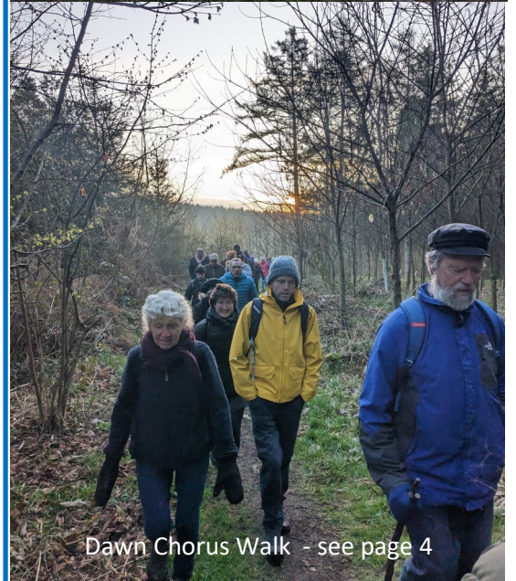
Dawn Chorus Walk - see page 4