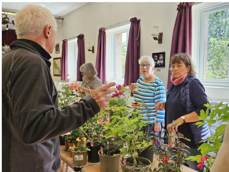
Kings Thorn & Little Birch Plant Sale see page 4

Table Tennis Tuesday 2nd July Little Birch Village Hall 7-9pm £3