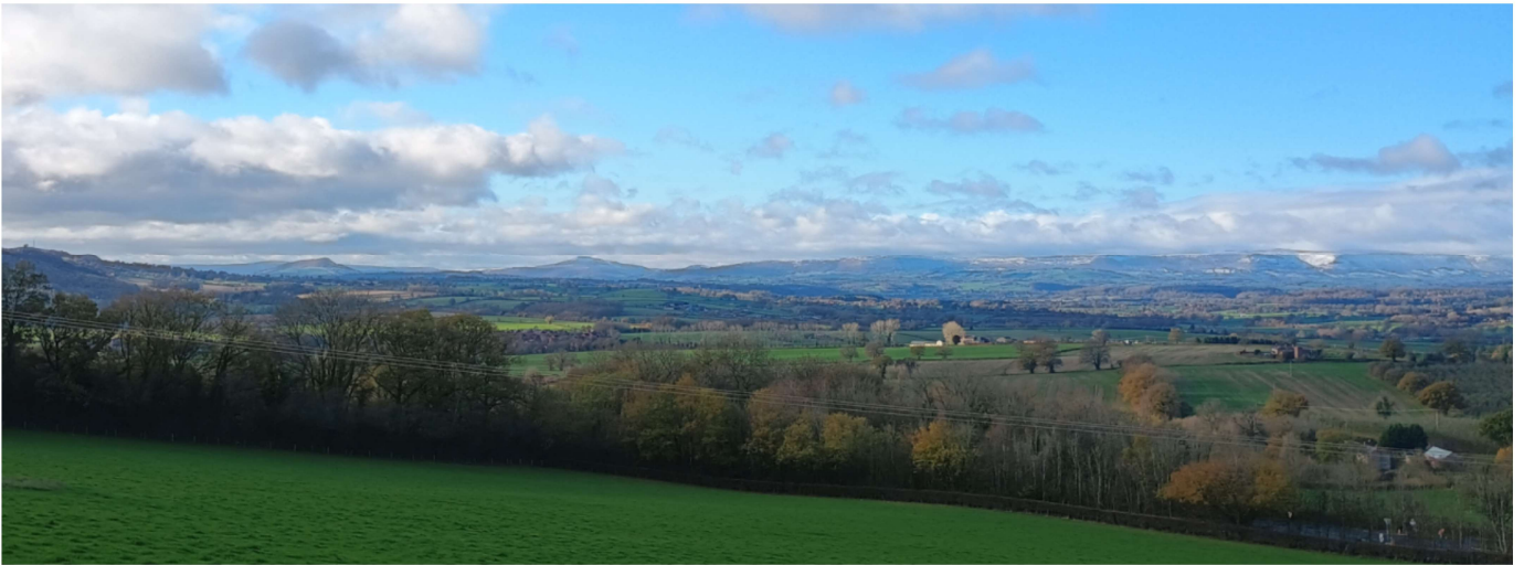
Golden Valley towards the snow capped Black Mountains 19/11/25