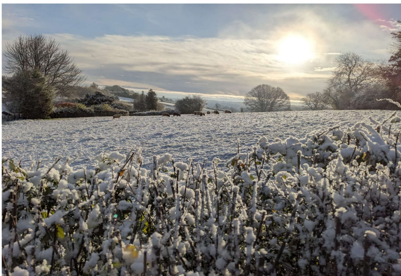
Winter in Kingsthorpe