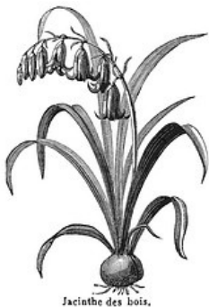
Jacinthe des bois.

For details and to book call 01981 540032